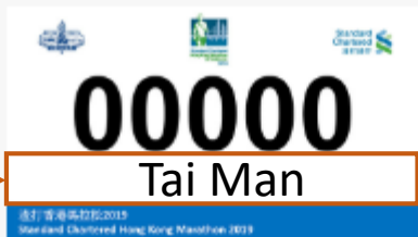
Sample Bib with first name

If "Yes", participant's English First Name provided will be printed on his/her bib